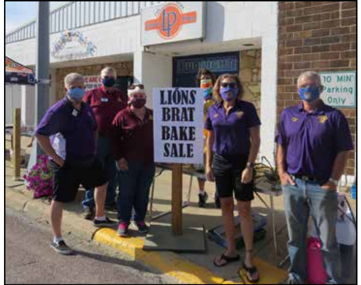
The Amboy Lions had much District support at their recent Brat and Bake Sale.